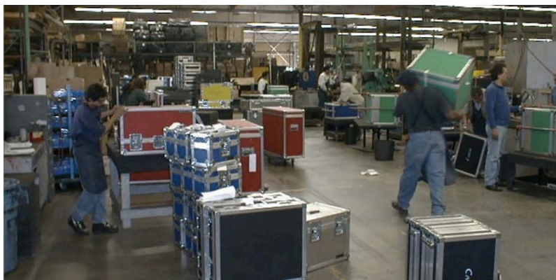
Anvil's new and larger facility in the City of Industry utilizes state-of-the-art equipment